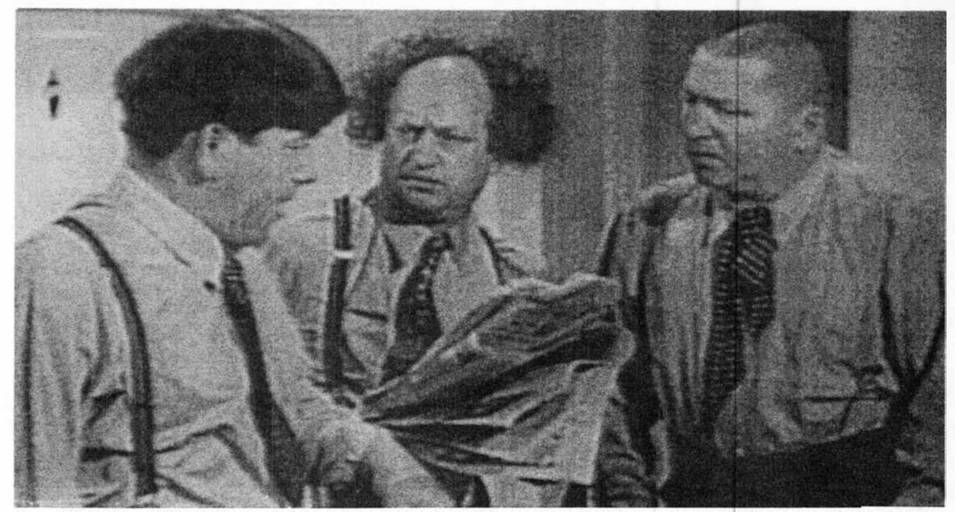
The Three Stooges' personal relations epitomize the continual, infantile violence among the inmates in Palmerston's Zoo.