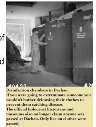
Disinfection chambers in Dachau. If you were going to exterminate someone you wouldn't bother delousing their clothes to prevent them catching disease. The official holocaust historians and museums also no longer claim anyone was gassed at Dachau. Only lice on clothes were gassed.

According to the AntiDefamation League, 20-30 percent of the world's population either is skeptical or denies the existence of the 'Holocaust'. This fact in itself warrants should allow any inquiry into the origins and bases for these results. All entities should welcome reviews of their beliefs. To do otherwise invites skepticism.